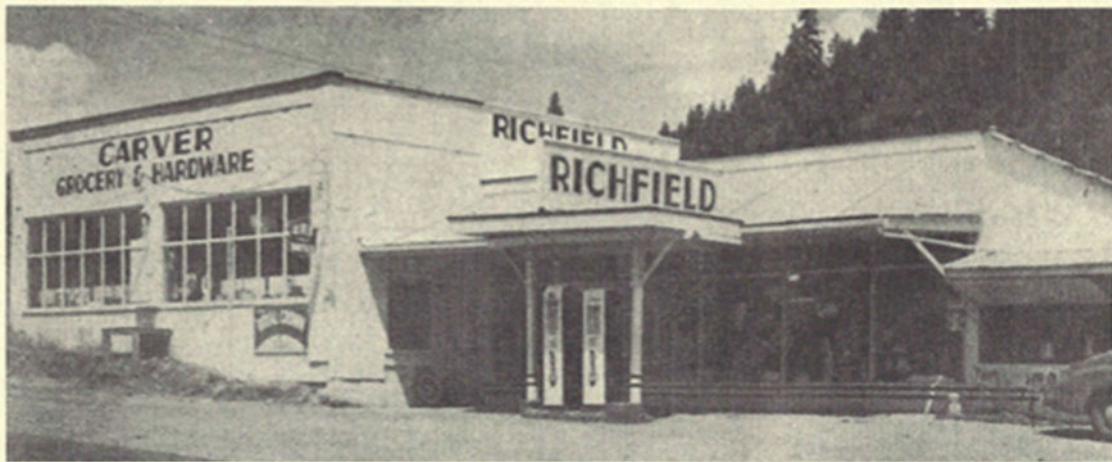
CARVER GROCERY &amp; HARDWARE - 1947